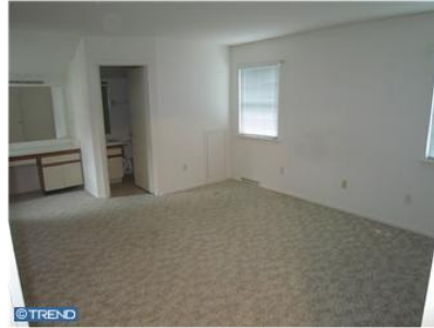
Bedroom - Main