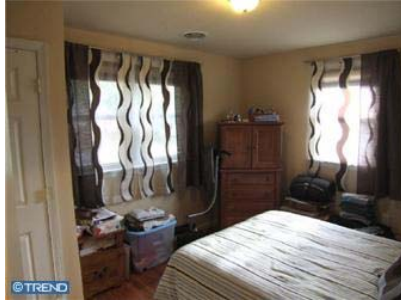
Bedroom - Main